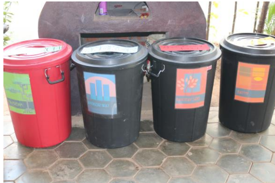
Collection Station for the Houses.