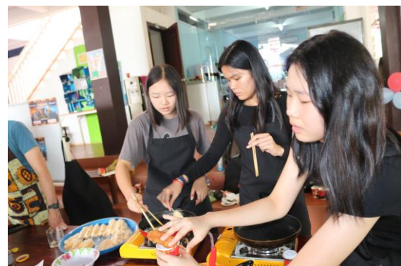
Belles busy at work