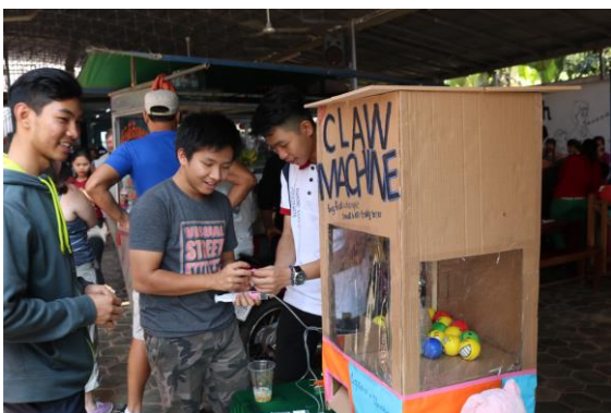
Delighted customers at the game machine.

On the 3rd February staff and students gave up their Saturday morning to volunteer to run activities and stalls for the annual school fair, which raises money in support of Angkor Children’s Hospital and Kantha Bopha. The fair was a great success and raised $2023 for these charities. The school fair once again demonstrated that the Primary and Secondary sections of ISSR can work together as one, to support such initiatives within the school. Thanks to all the teachers and students who used their diverse talents and creativity to provide activities and stalls for the event.