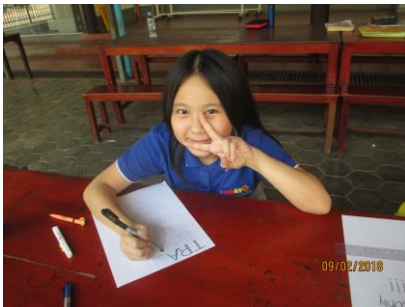
Designing the labels