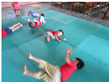
Education is not preparation for life; education is life itself.