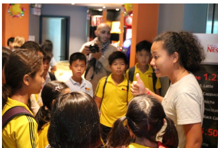
Some students from Primary School enjoyed watching the film Fauna in Focus at the cinema