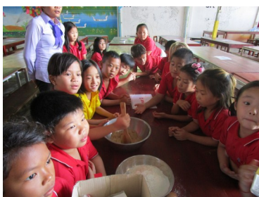
Year 2 enjoyed making cookies during Topic.