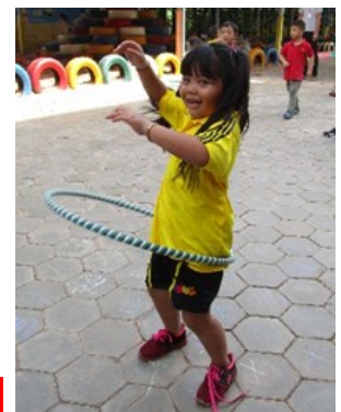
Reception 2A showing off their amazing hoola-hooping skills, during their outdoor learning.