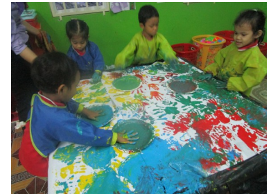
Reception 1B enjoy to painting with their hands when learning about their bodies—especially their hands!

At ISSR, we are a community. As such we need to respect each other and the values and opinions we hold. Everyone working at the school makes a great effort to ensure that all children feel safe and are able to achieve to the best of their ability. We value the opinions and ideas of parents and we ask that if you have an opinion or a comment about our school that you wish to share, please do. However, we also ask that you speak to our members of staff with respect. Respect is something that we endeavour to teach the children about each day. We know and appreciate that the majority of parents understand this but it is important that we all, as a community, understand and adhere to this.